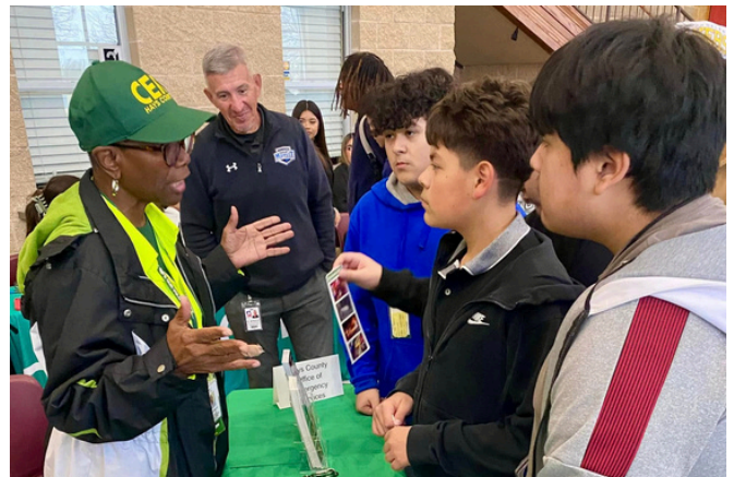
CERT volunteers were on hand alongside Hays County OES staff to showcase options for careers in emergency services at the the Hays CISD “Career on Wheels”.

Know someone who might want to help us build a more resilient community? Share our website and social media!